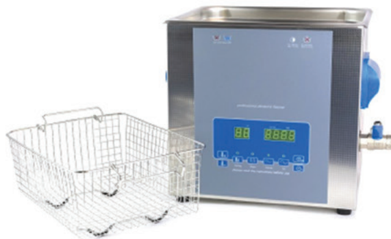
Ultrasonic Cleaner Tank 9 Litres - UT8091/EUK