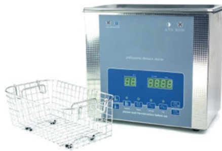
Ultrasonic Cleaner Tank 3 Litres - UT8031/EUK