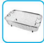
Cleaning Basket for 3L Ultrasonic Tank UTBAS03