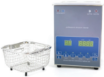
Ultrasonic Cleaner Tank 2 Litres - UT8021/EUK

All Shesto Ultrasonic Cleaners come with a basket fitted and include temperature control and timer functions as well as degas, delicate and full power cleaning modes. From 6 Litres and up, all tanks are fitted with drainage taps for easy maintenance.