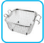
Cleaning Basket for 2L Ultrasonic Tank UTBAS02

All Shesto Ultrasonic Cleaners come with the matching basket size, additional baskets are also available separately. It is highly recommended to use a wire mesh basket as this will help minimise and reduce ultrasonic hot spots during the cleaning process. All our baskets have convenient handles which overhang the bath lip for safe and easy repositioning during the cleaning cycle.