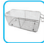
Cleaning Basket for 6L Ultrasonic Tank UTBAS06