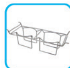
Cleaning Basket for 6L Ultrasonic Tank UTBBKS06