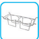
Beaker Basket for 3L Ultrasonic Tank UTBBKS03