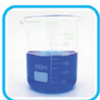
Measuring Beaker - 300ml UTBE300

These beakers are ideal for small parts such as electronic components and jewellery. The beakers are suspended in the tank using the appropriate basket, solution is only required within the beaker, the tank only need be filled with water to allow conductivity of the ultrasonic waves. Separating parts to individual beakers allows you to group components and use two different solutions simultaneously, as well as reducing the amount of solution required.