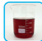
Measuring Beaker - 500ml UTBE500