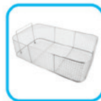
Cleaning Basket for 27L Ultrasonic Tank UTBAS27