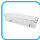
Cleaning Basket for 10L Ultrasonic Tank UTBAS10