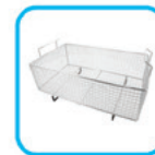
Cleaning Basket for 36L Ultrasonic Tank UTBAS36