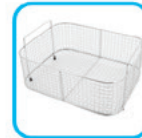
Cleaning Basket for 9L Ultrasonic Tank UTBAS09