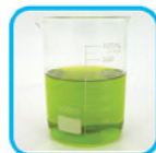
Measuring Beaker - 400ml UTBE400